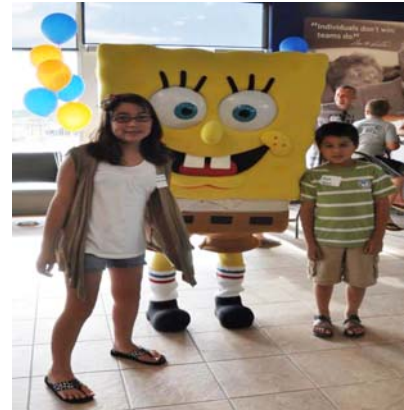
Scholarship awardees, children and supporters enjoy hotdogs, Naturals baseball, and each others' company at the annual Scholarship Strike Out, an event hosted by SPSF of NWA Alumni. School-aged children of current awardees are given $50 school supply stipends sponsored by Wal-Mart Foundation. Through Pack the Park For Charity, Arvest Ballpark donated $3.00 per ticket sold by SPSF of NWA.