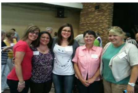
Pope and Yell County Single Parent Scholarship Fund was joined by members of nearly 300 residents of the community and surrounding areas for its 14 th Annual Shrimp and Catfish Dinner fundraiser. This year's event raised nearly $13,000, providing money for almost a quarter of the affiliate's yearly scholarships.