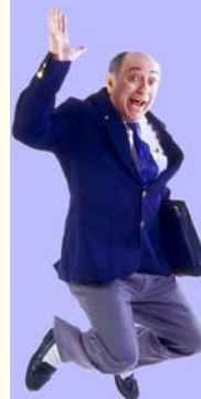
A High Five